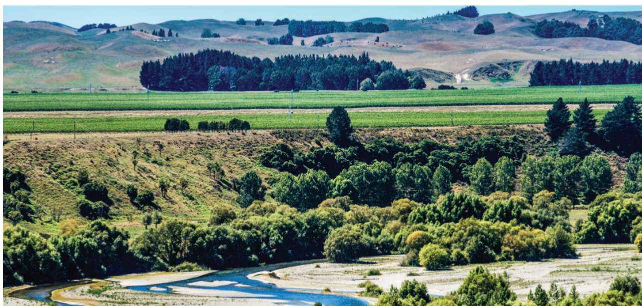
CROWNTHORPE TERRACES VINEYARD, HAWKE'S BAY.