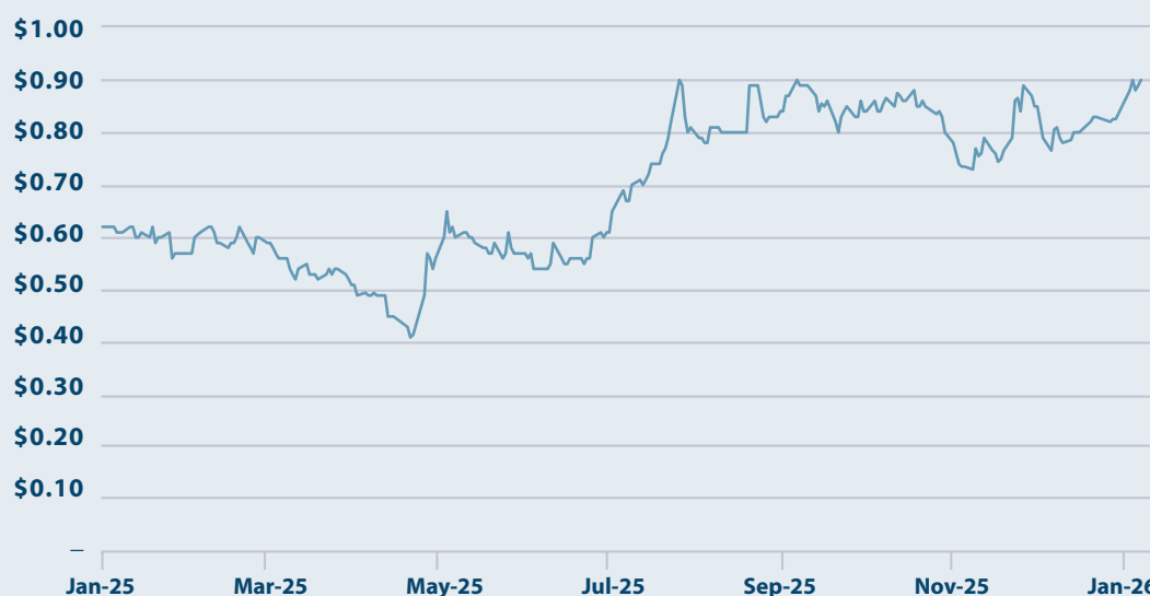
Rakon share price performance from 1 January 2025 to 9 January 2026